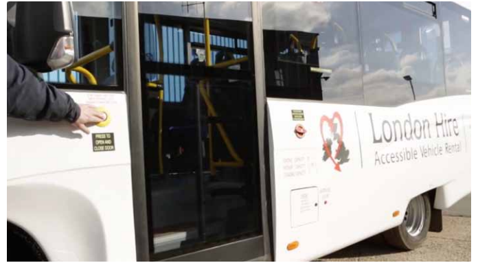
Fully automatic side door entry.