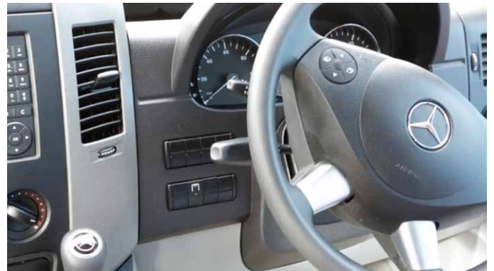
Fully equipped drivers cab.