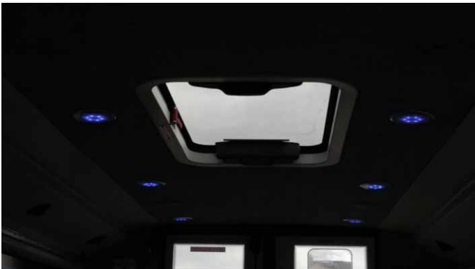
Interior sensory lighting.