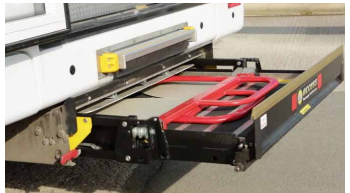
PLS access underfloor lift 1410mm x 825mm 400kg load capacity as standard.