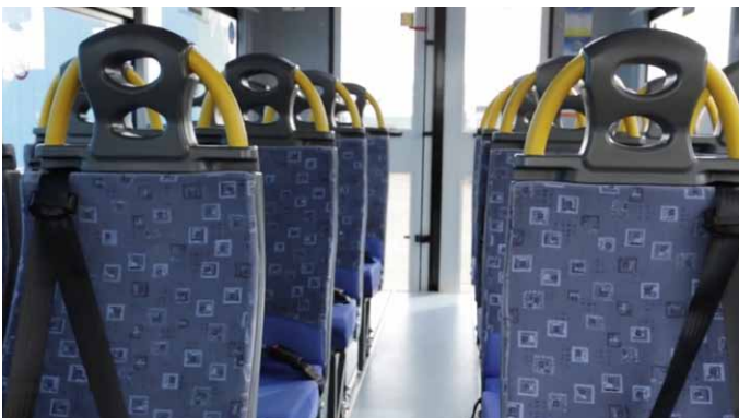
Open style grab handled headrest designed to assist and support the passenger.