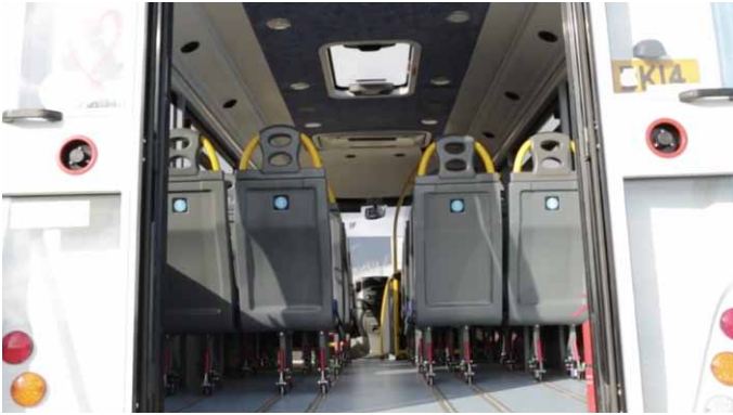
Fully tracked tested floor complete with fully removable seating.