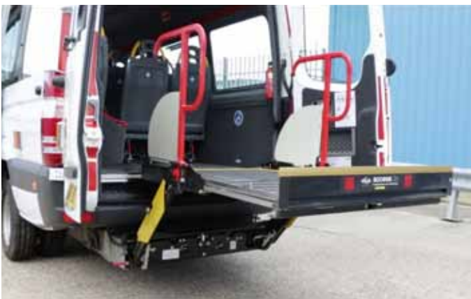
PLS access underfloor lift 1410mm x 825mm 400kg load capacity as standard.