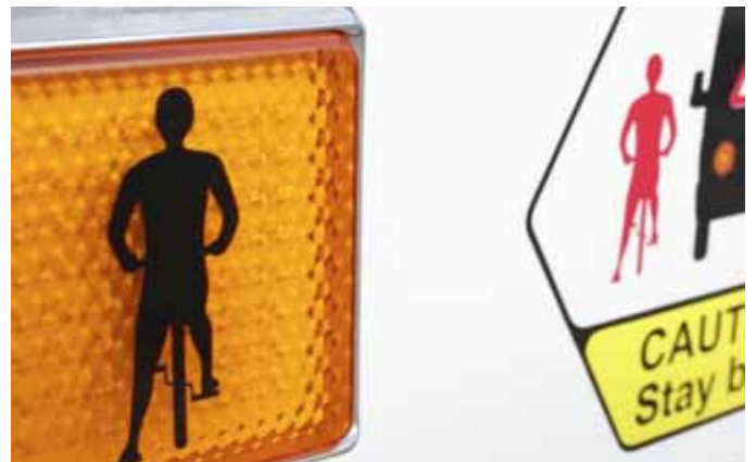
Cycle Awareness Safety Feature: 3 warning lights flash and voice recognition.