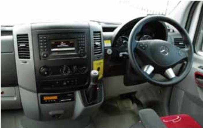
Fully equipped drivers cab.