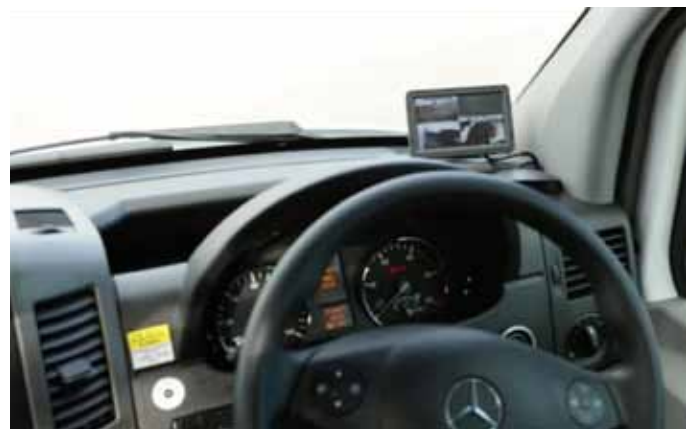
Reversing camera with dashboard screen display and proximeter alarm.