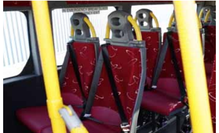
Fully tracked tested floor complete with fully removable seating.