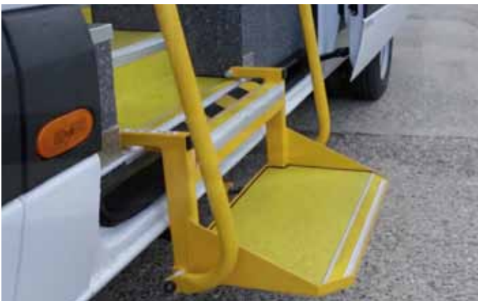
Hi-visibility deep low entry manual side step with twin safety rails for ease of boarding.