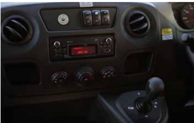
Fully equipped drivers cab.