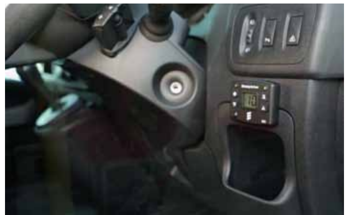
Full climate control for passenger comfort.