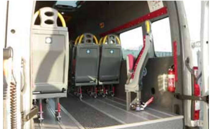
Fully tracked tested floor complete with fully removable seating.