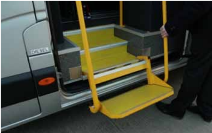
Hi-visibility deep low entry manual side step with twin safety rails for ease of boarding.