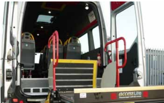
PLS access underfloor lift 1410mm x 825mm 400kg load capacity as standard.